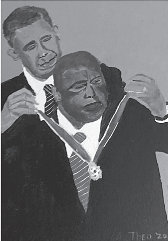
President Obama presenting the Presidential Medal of Freedom to John Lewis on February 16, 2011, who made “meritorious contributions to the security of national interests of the United States, world peace, cultural and other significant public endeavors.” 190 John Lewis spent his life advocating for voting rights for all Americans. He led the “Bloody Sunday” march from Selma to Montgomery for Black voting rights in 1965. He led a peaceful march across the Edmund Pettus Bridge, but they were attacked by police on horseback. Lewis was clubbed and almost killed.