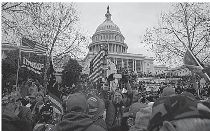
On January 6, 2021, a mob of 2,000–2,500 supporters of President Donald Trump stormed the Capitol Building in Washington, DC.

The tide has turned. However, I heard someone on CNN say it’s not over until Joe Biden lifts his hand off the Bible.